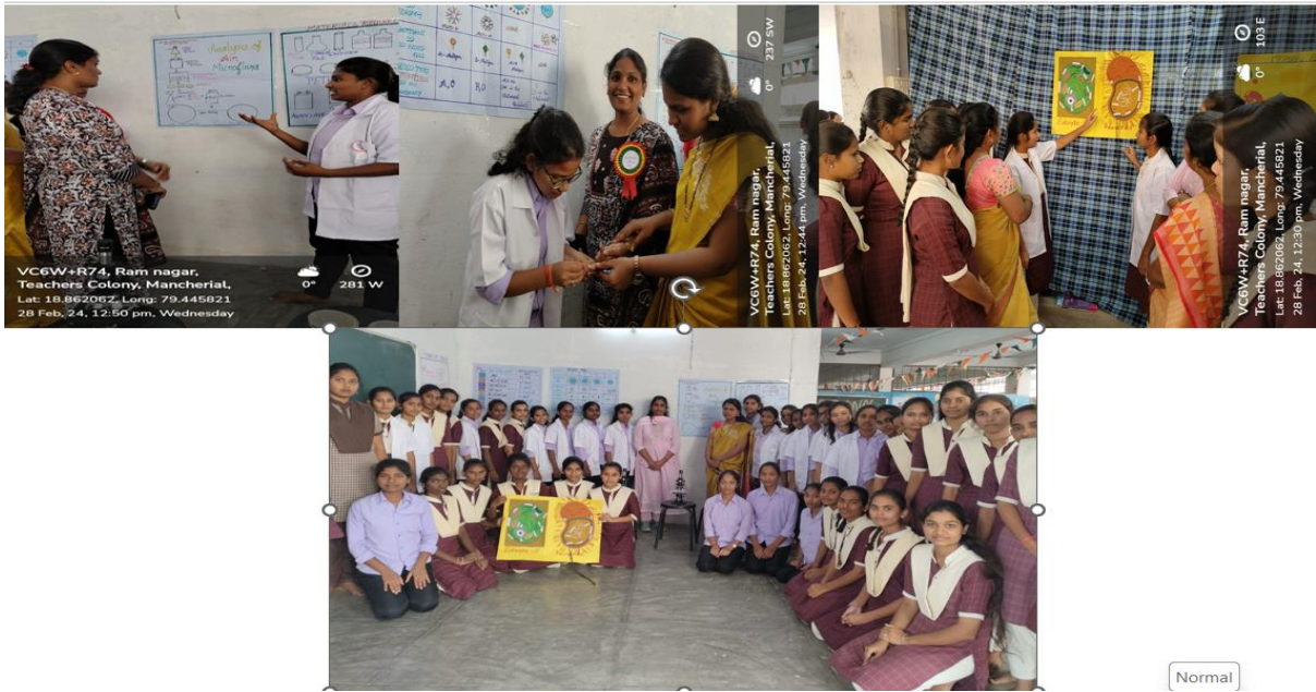
Gene Health Connect: Mobile Science Exhibition by Life Sciences departments