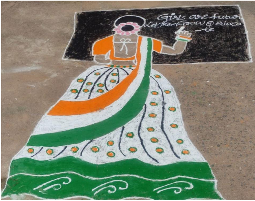
Savitri Bhai Pule Jayanthi