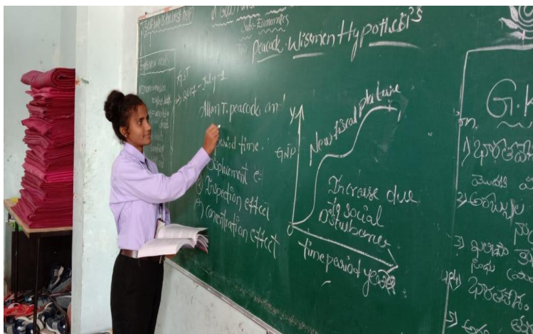
Student Seminar on Peacock Wisemen Theory by the Department of Economics department