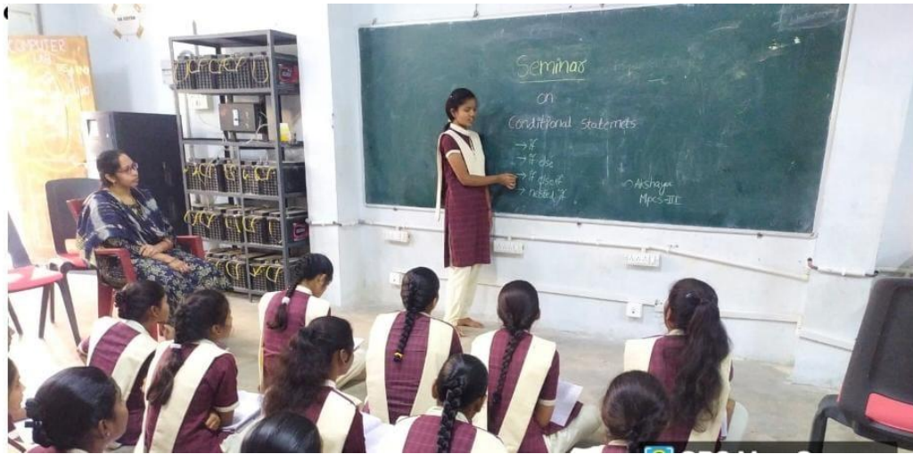
A seminar is conducted on conditional statements in C programming from the Computer Science department