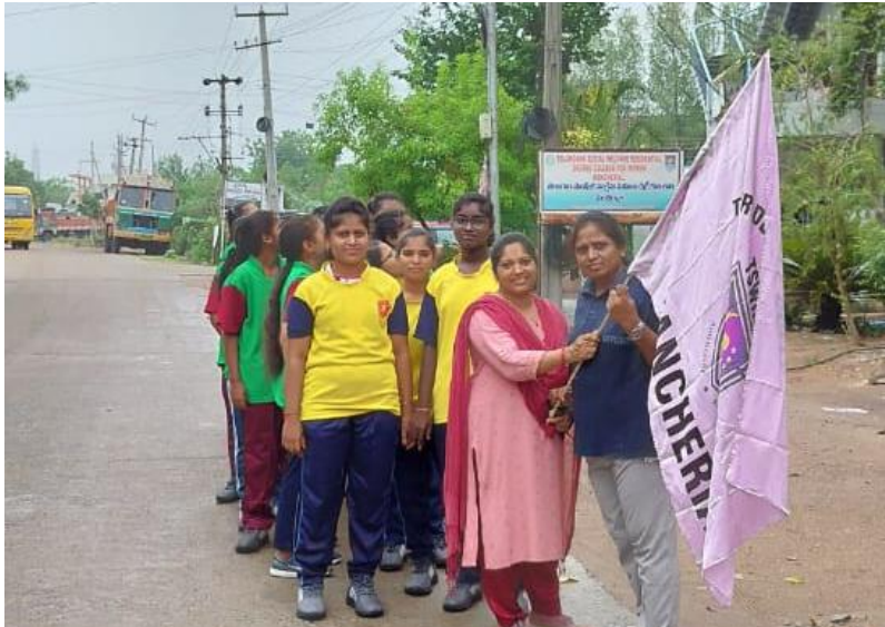
Yoga Day celebrations by faculty and students in the presence of NSS units 1 and 2 International