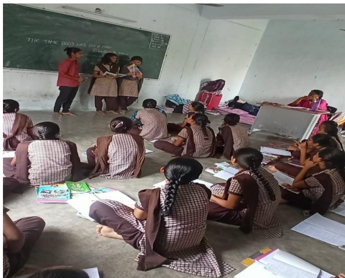
Student Seminar on "The Tame bird was in a cage" from the Department of English